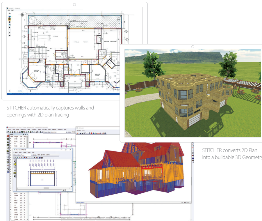
STITCHER automatically captures walls and openings with 2D plan tracing