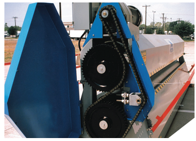
Extra heavy double-100 chain and rugged chain tensioner