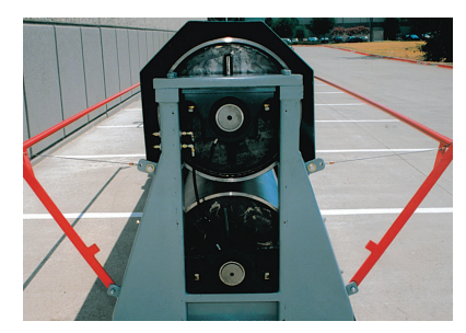
Oversized bearings engineered to carry a 30,000 lb load