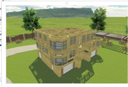
STITCHER converts 2D Plan into a buildable 3D Geometry