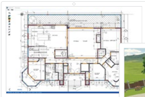
STITCHER automatically captures walls and openings with 2D plan tracing