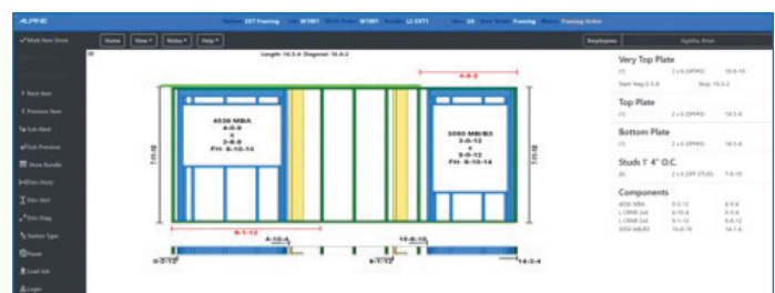
Framing Station with Custom Dimensions

Assemblers will have access to a clean, modern interface which shows them all the information they need to build a panel. They will also be able to snap custom dimensions and add/view production notes helping eliminate errors. By interacting with the shop stations via simple keystrokes, the shop employees can log valuable production data which provides management with real-time status.